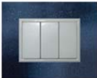
QuBe coverplate blue STARS NIGHT

For QuBe Stars Night coverplate we only inspired to a look in the sky